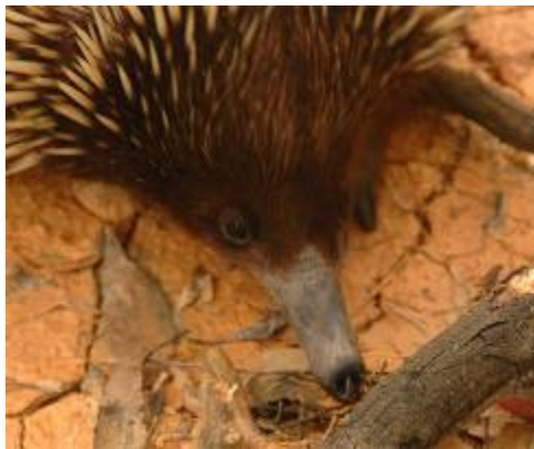
A nosy Echidna