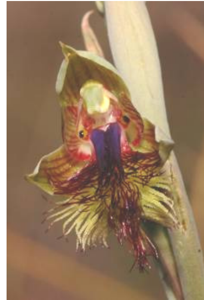
Copper Bearded Orchid ( Calochilus campestris ) with "face" resembling a weird marine monster D. Wilson

For interest sake, he will also refer briefly to several case histories of local "controlled burns" which have not followed the appropriate practices for sensitive critical habitats of endangered species of birds and plants.